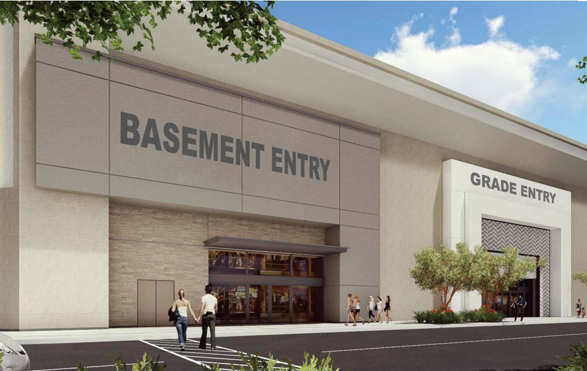
Rendering (West Facing)