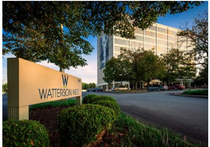
1941 Bishop Lane-1924