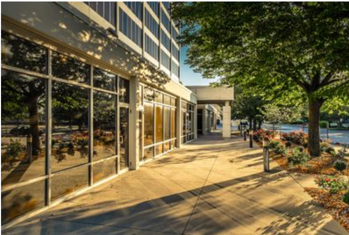
1941 Bishop Lane-8614