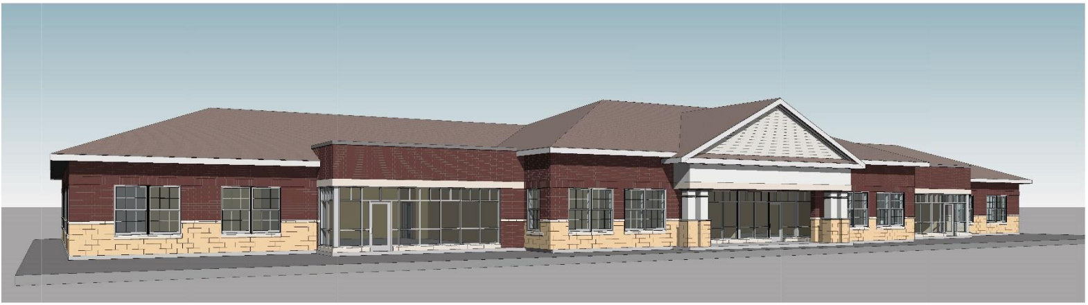
3D View - Front Elev.