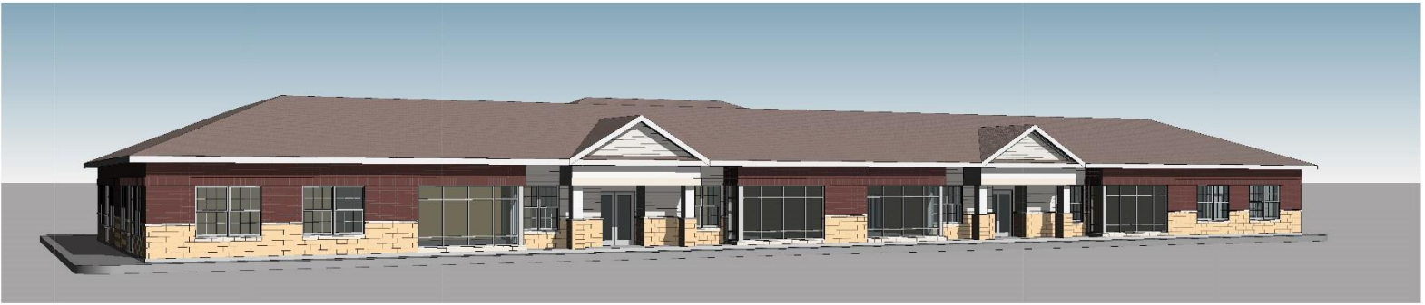
3D View - Rear Elev.